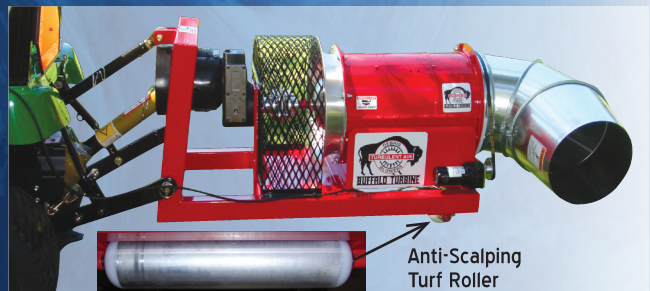
Anti-Scalping Turf Roller