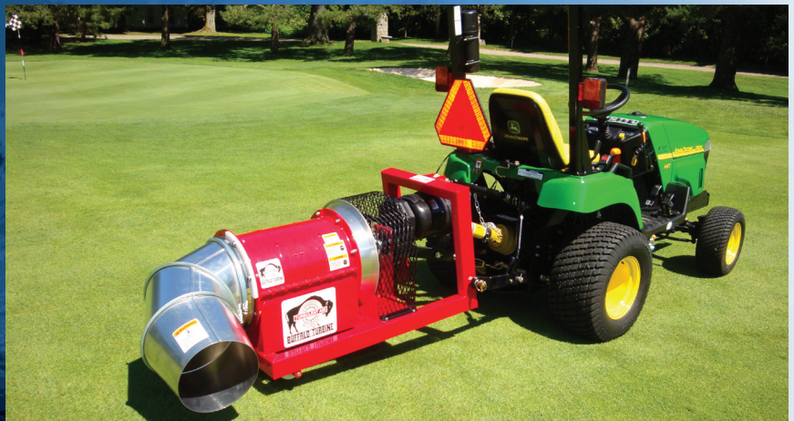
Buffalo Turbine Part # BT-CPTO / 20 HP @ PTO